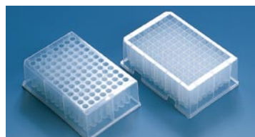
BRAND 96-well round well (1.1mL) and square-well (2.2mL) Deep-Well Plates, PP