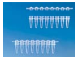
BRAND PCR* tube strips