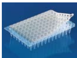
96-well PCR* plate, unskirted with TPE mat.