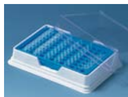
PCR* Rack and Box