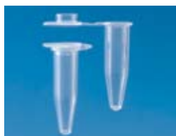
BRAND PCR* tubes