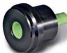
Single-channel adapter for pipettes with tip mounted