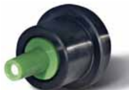
PE filter in single and multichannel adapters