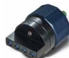
Multichannel adapter for pipettes with and without tip