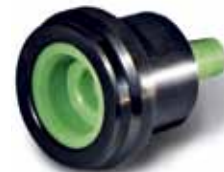
Single-channel adapter for pipettes without tip