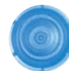
Round polyethylene caps provide plug-seal for reliable sample storage. Available in 4 colors!