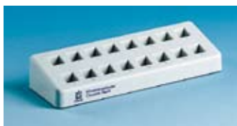
Polypropylene cuvette rack with 16 numbered positions. Autoclavable to 121°C.