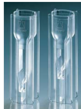
BRAND ultra-micro UV-Cuvettes. 8.5mm (left) and 15mm (right) window heights.

Not sure of the beam height of your instrument? Check our website at www.brandtech.com/beam_heights.asp for help with cuvette selection.