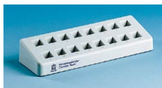
Polypropylene cuvette rack with 16 numbered positions. Autoclavable to 121°C (250°F)