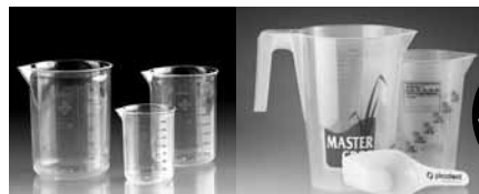
Beakers, Pitchers, Scoops, Funnels and more!

Details at www.brandtech.com or call for a catalog of our line of PFA, Volumetric & General Laboratory plastic products, including bottles, beakers, sample vials, funnels and scoops.