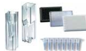
Life Science Plastics