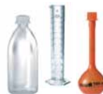
Volumetric & General Lab Plastics