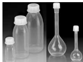
PFA Labware for Trace Analysis