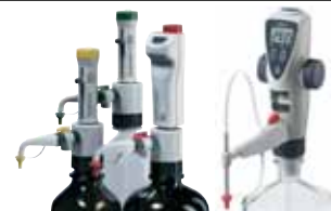
Bottletop Dispensers & Burettes

Playing cards © 2008 BrandTech Scientific, Inc.