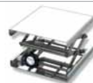
Stainless Support Jacks