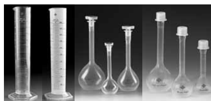
Class A & B Graduated Cylinders and Class A & B Volumetric Flasks with stoppers or screw caps

Details at www.brandtech.com or call for a catalog of our line of PFA, Volumetric & General Laboratory plastic products, including bottles, beakers, sample vials, funnels and scoops.