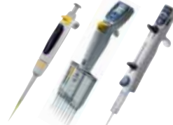
Manual, Electronic & Repeating Pipettes