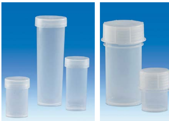
Sample Vials, with snap caps