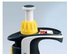
Red recalibration flag indicates adjustment from factory specifications.