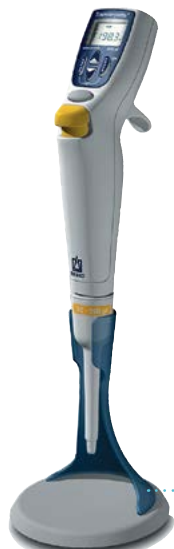
Single channel stand

Transferpette® electronic pipettes from BRAND® – performance, value, and unbelievable comfort