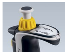
Covered nameplate—identifies pipettes without messy tape!