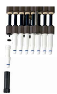
Easy cleaning and maintenance