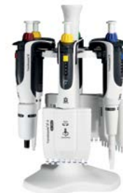
Benchtop rack for 6 Transferpette® S single- or multi-channel pipettes.