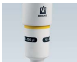
Integrated shaft coupling