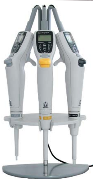
Charging stand for up to three single channel pipettes (excluding 5 mL)